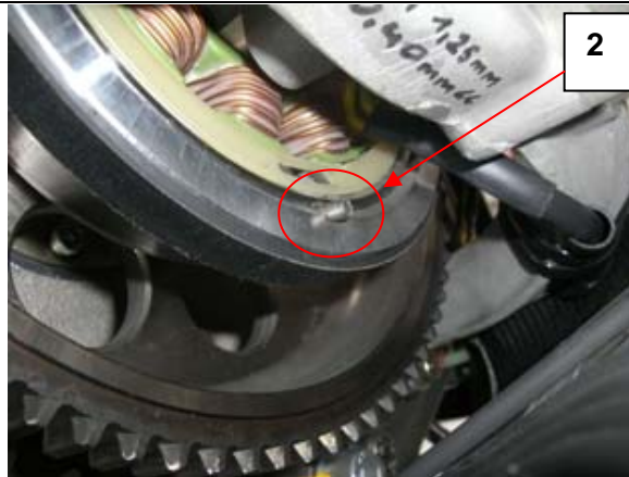
Figure 2: Loose scrub screws