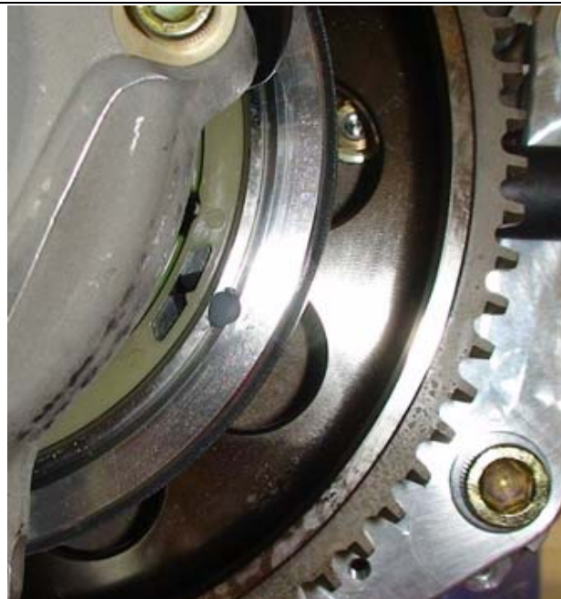
Figure 3: Rework solution with LOCTITE "Hysol" 3450