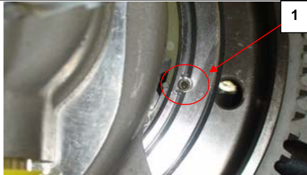
Figure 1: Scrub screw assembly